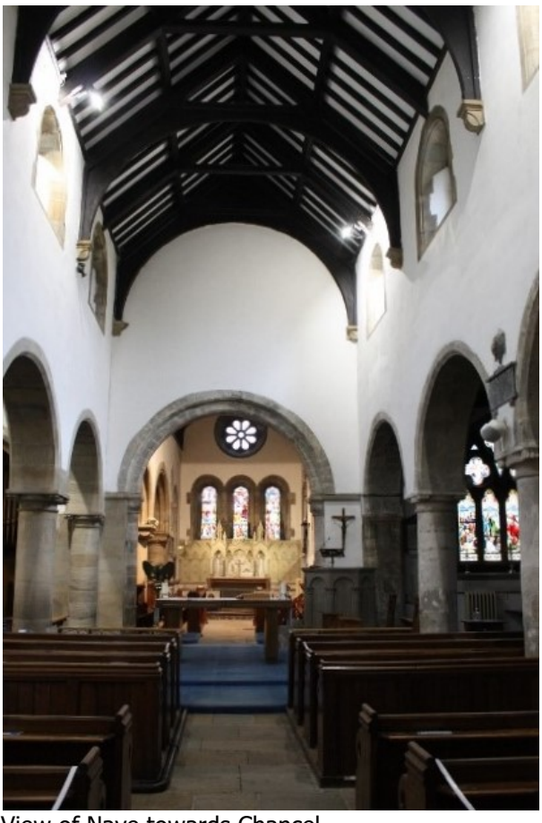
View of Nave towards Chancel