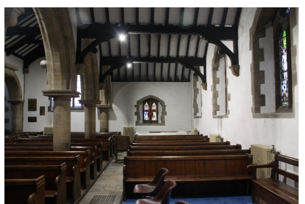
View of North Aisle to west