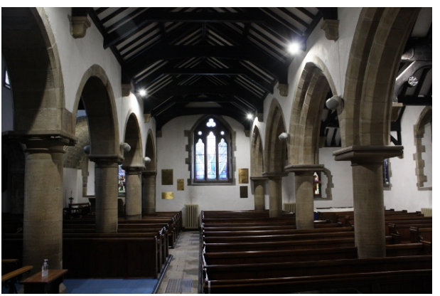
View of Inner Aisle to west