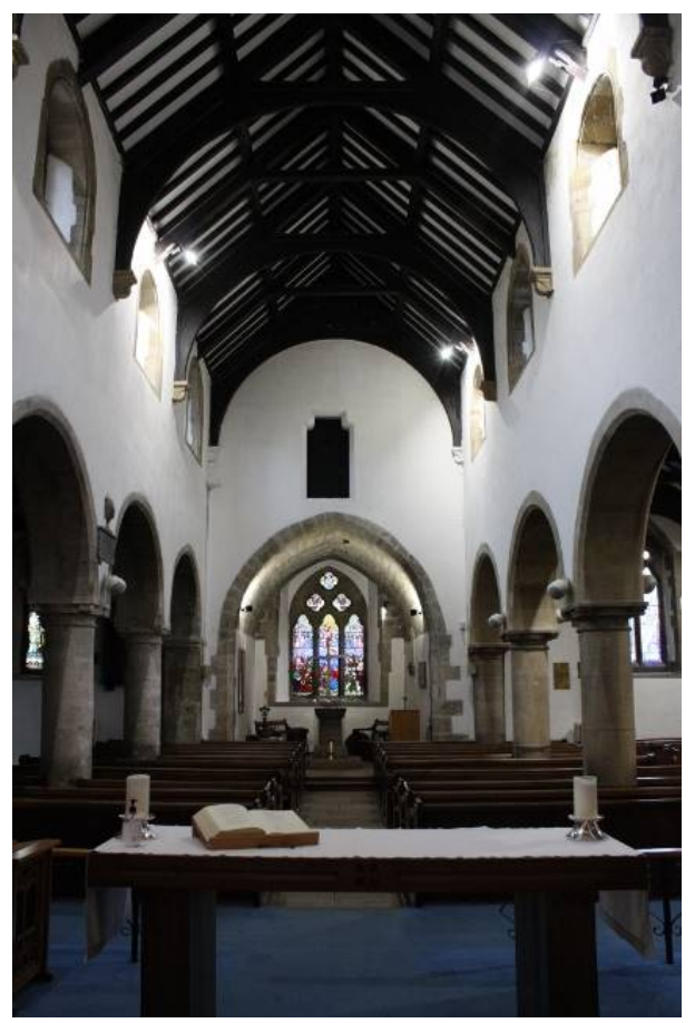
View of Nave to west