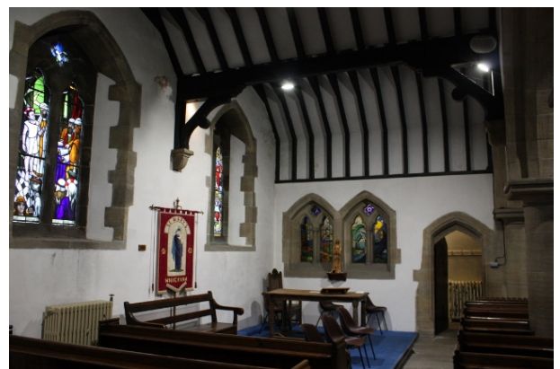
View of North Aisle to north east