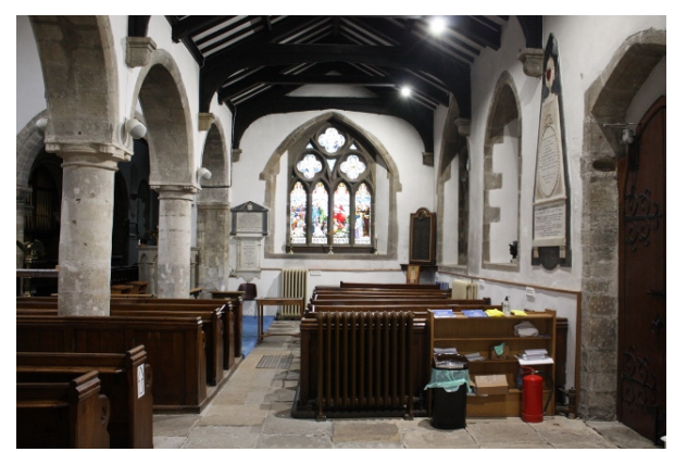
View of South Aisle to east