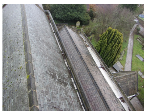
View of roofs from Tower