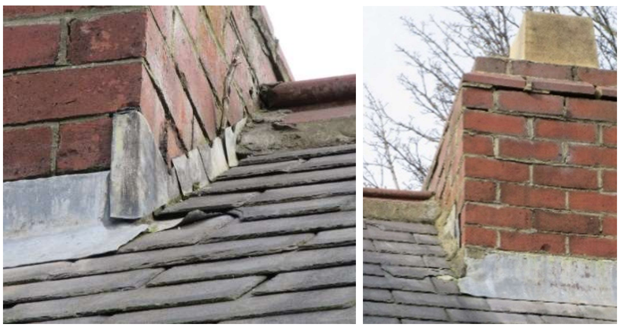
Lead cover flashings missing from both S sides of the chimney