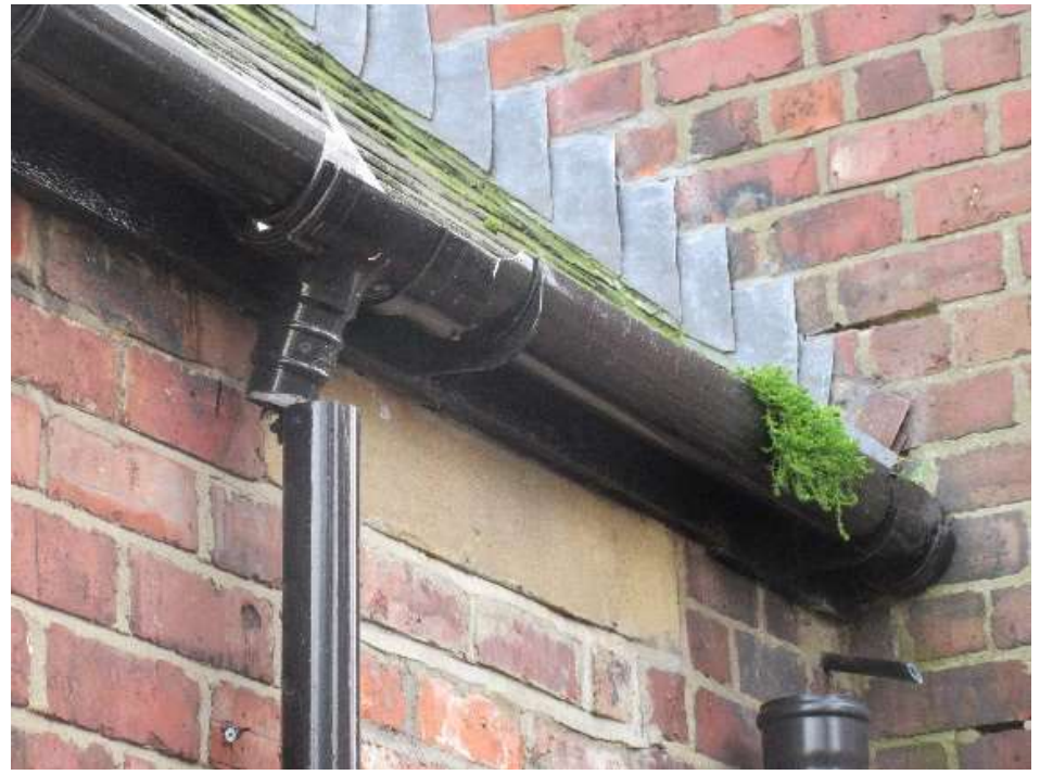
W side of offshot – outlet disconnected from gutter and pipe and gutter blocked

12. The gutters are upvc half round bracketed from fascias with downpipes and shoes, mixed black and grey. Most gutters seem sound but blocked by plants at the S ends of both offshot gutters and at the short Nave NW gutter.