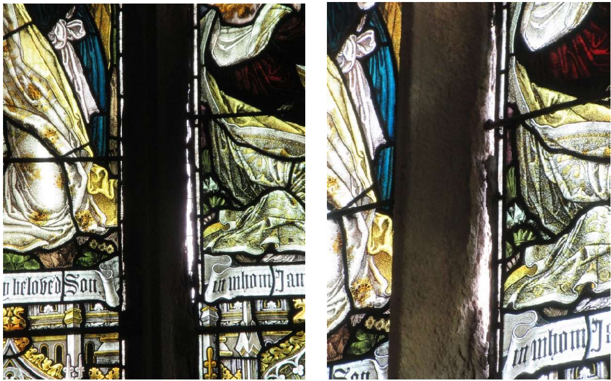
Daylight through the gap between the decayed mullion and the centre light glass