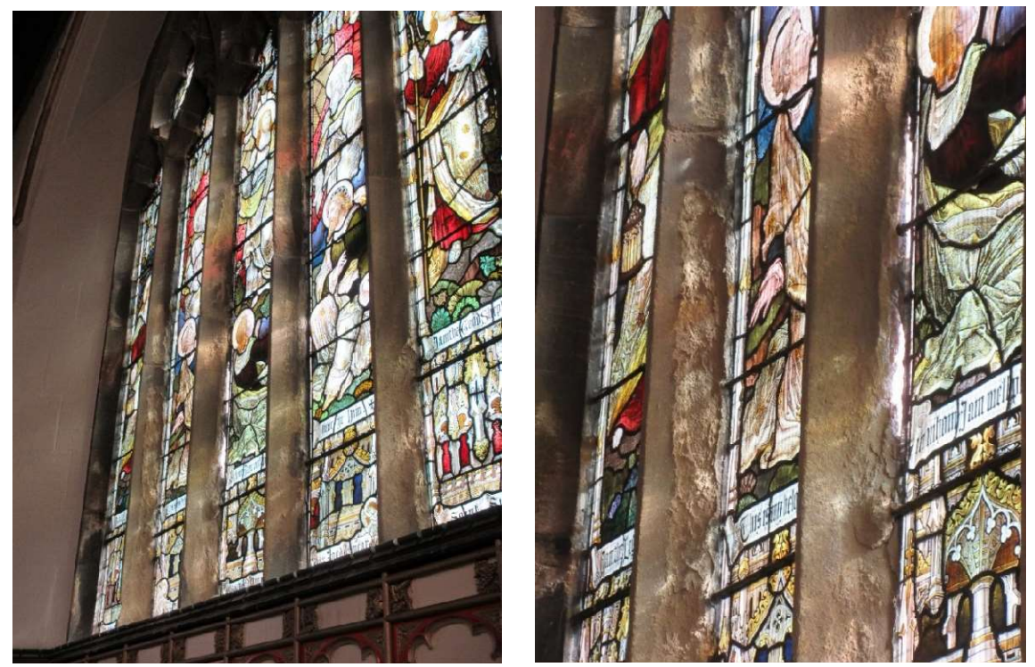
Details of two N mullions, daylight next to N central – see also photos after paragraph 56

Outside the bottom of the mullion S of centre two lengths of stone have broken off and lie inside the grill. All mullions appear to remain strong enough at present but decay may continue and in time some replacement will be needed.