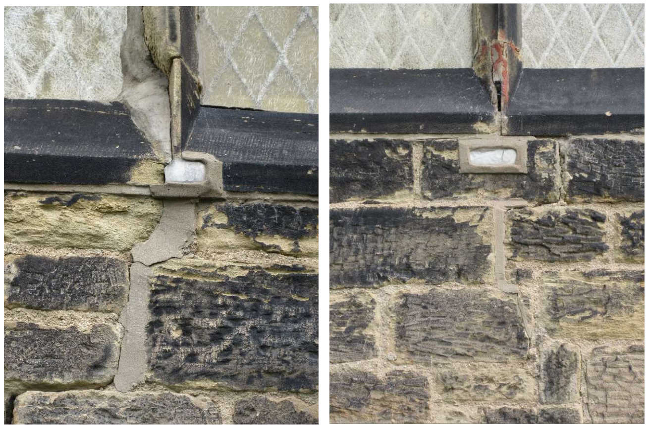
Nave SW window