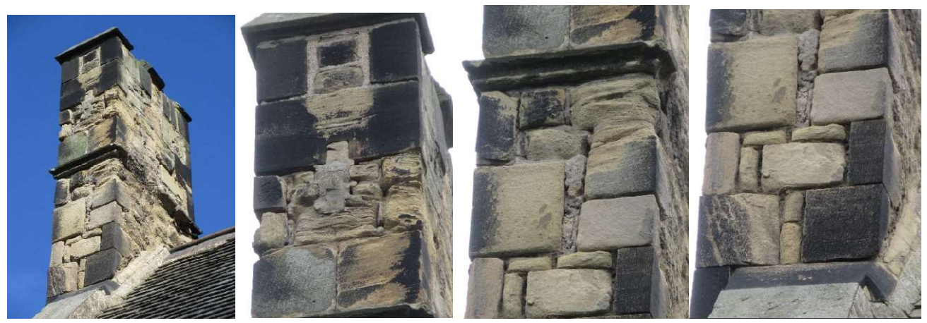
W end – little pointing and stone decay begun