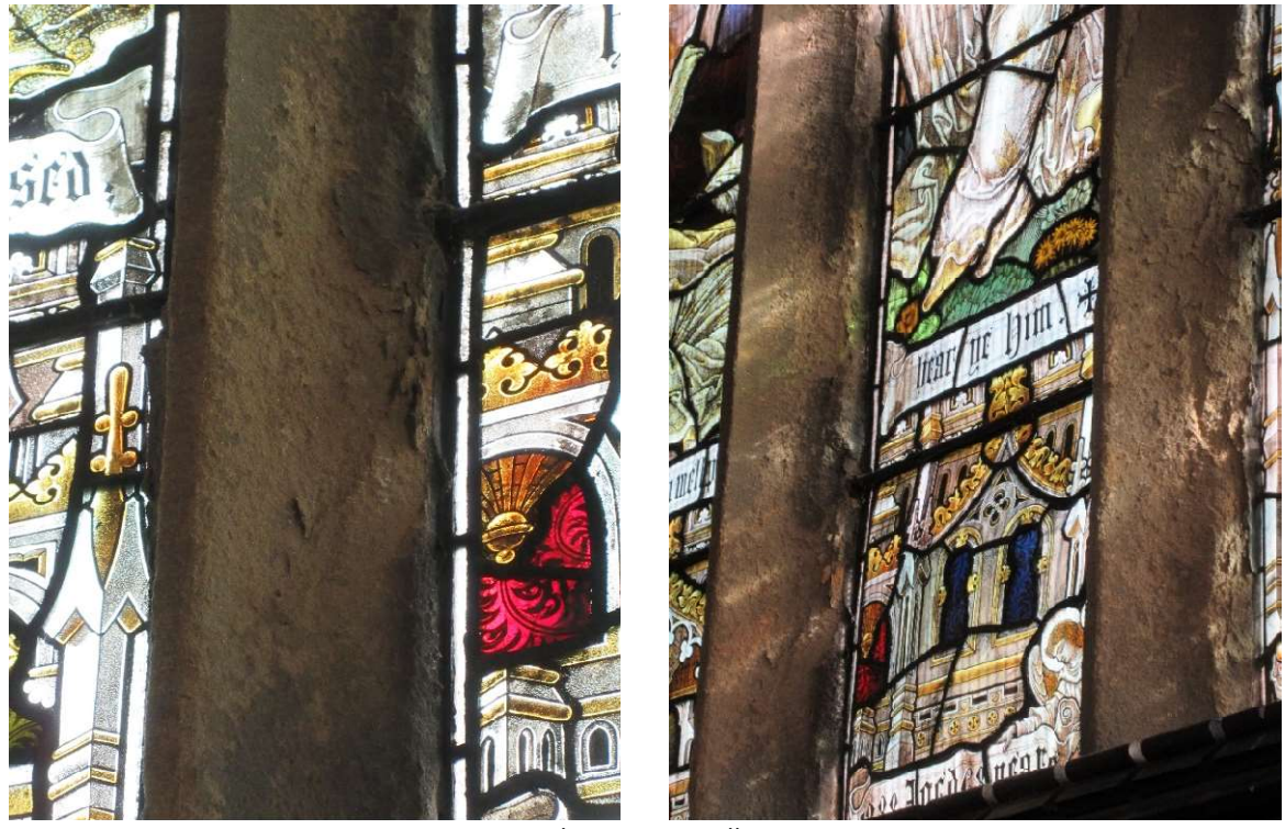
Details at two S mullions