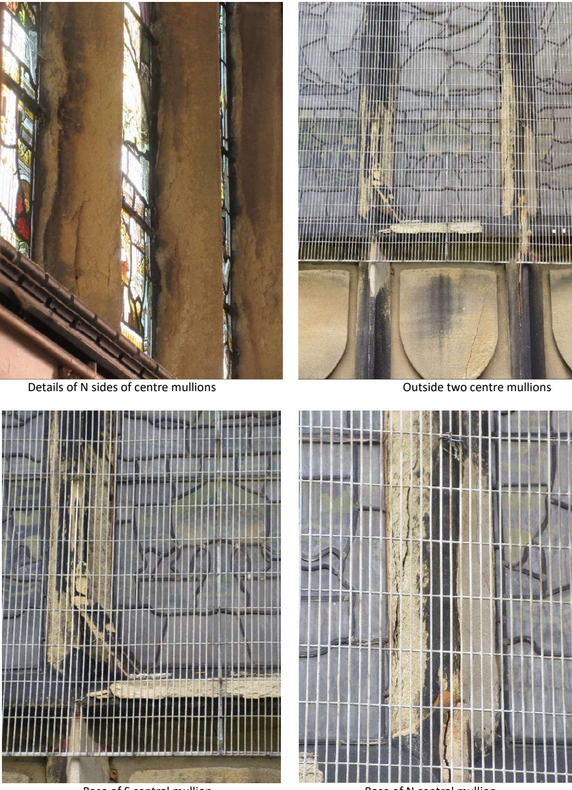
Base of S central mullion