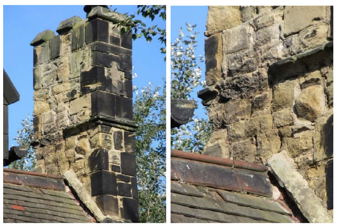
Chimney S and E – widespread decay, part of string course (should throw off water) missing and hole lets wind through