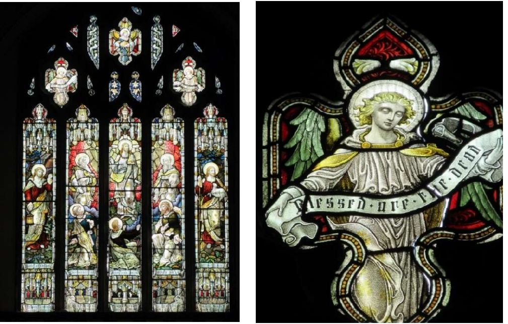
and detail of openings between lead and glass in the slightly spread tracery at the top left angel

Galvanised wire mesh guard over whole window sound but visible against sun.