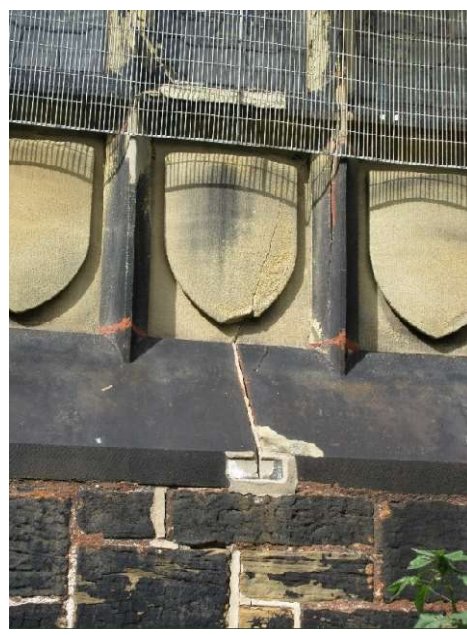
E window cill