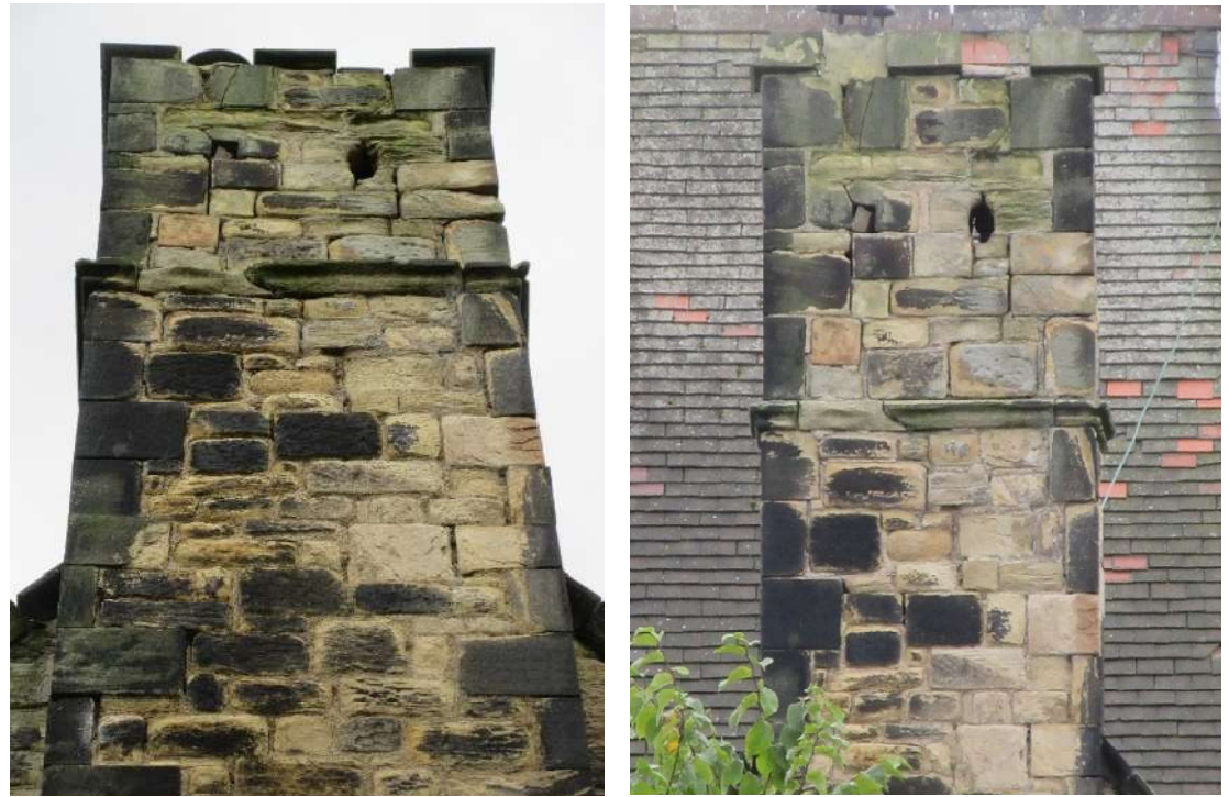
Chimney N side – general decay and daylight though holes both sides of one flue, letting wind through