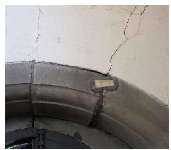
Dropped stone in Porch inner arch