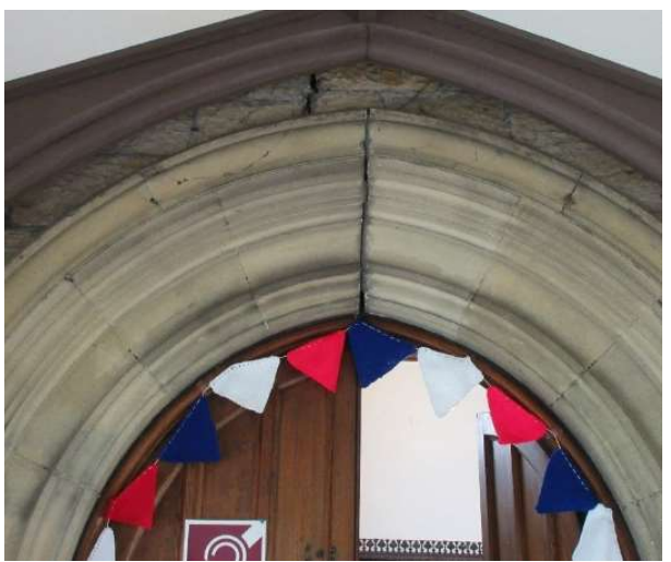
Open joints over Porch outer arch