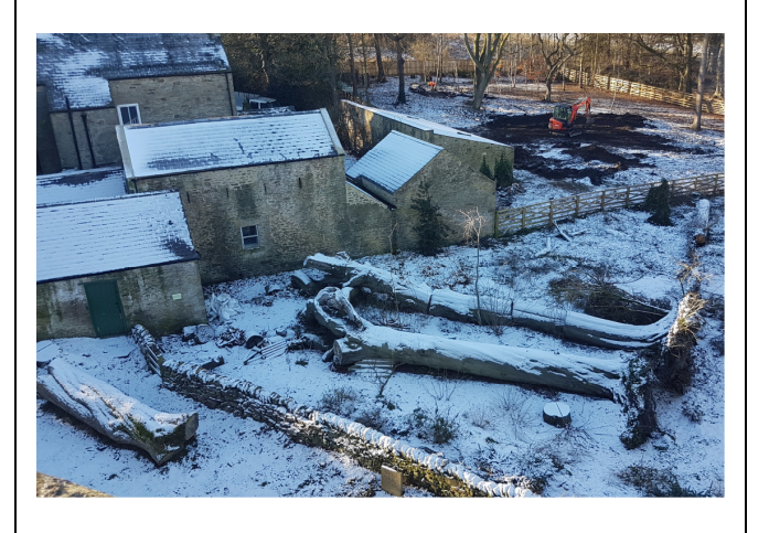
Trees felled by Storm Arwen (12.4)