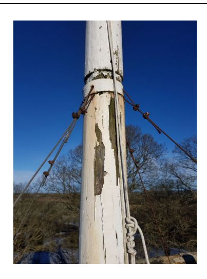
Flaking paint to flagpole (6.3)