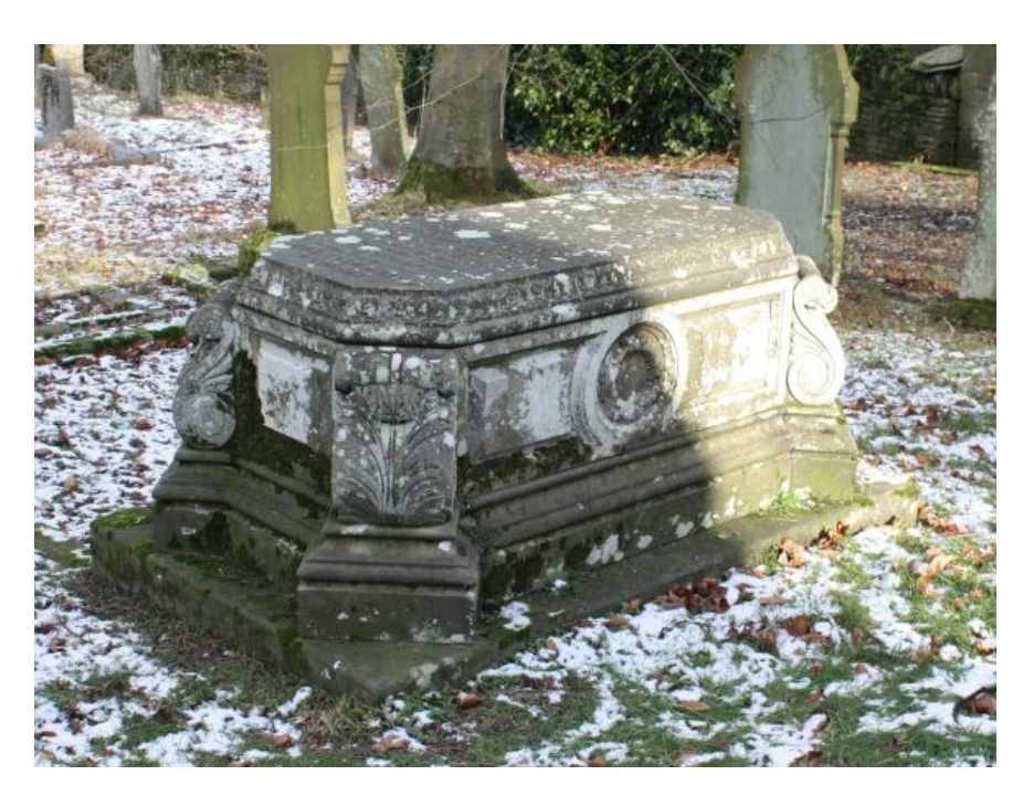
The Greenwell tomb (12.5)