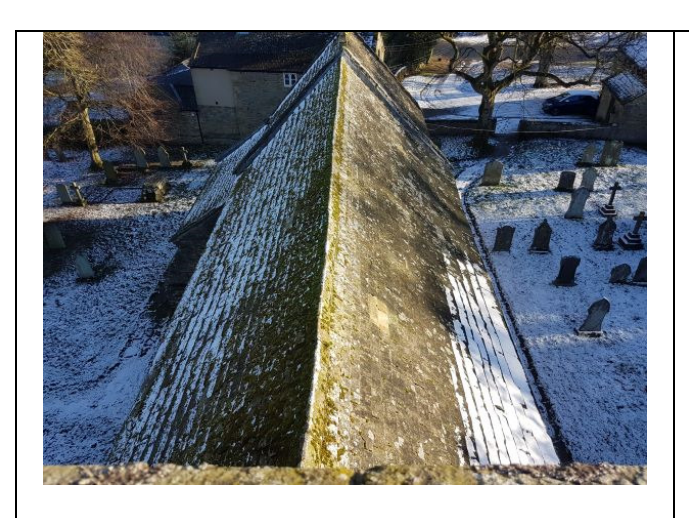
View of Nave and Chancel roofs from Tower