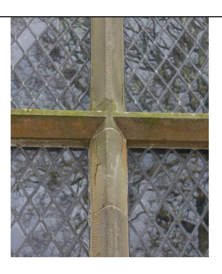
Nave north window n(v) – cracks to mullions (6.7)