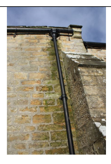
Wall staining from leaking Nave south hopper (6.2)