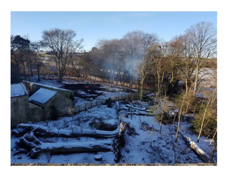
View from Tower showing fallen trees (12.4)