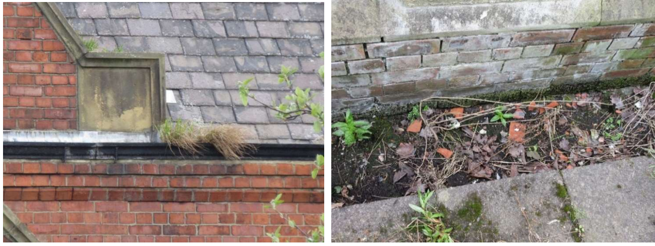
Gutter choked by plants before clearance at the inspection

15. The long level gutters are prone to silting and blockage, needing clearance at least once a year. The high gutters (Chancel and Nave) are very difficult to reach. During the inspection all gutters were being cleared of silt and thick plant growth by motorised suction pipe from ground level.