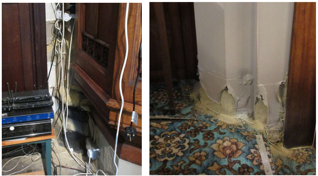
Paint and stone loss outside and inside the pulpit continues slowly