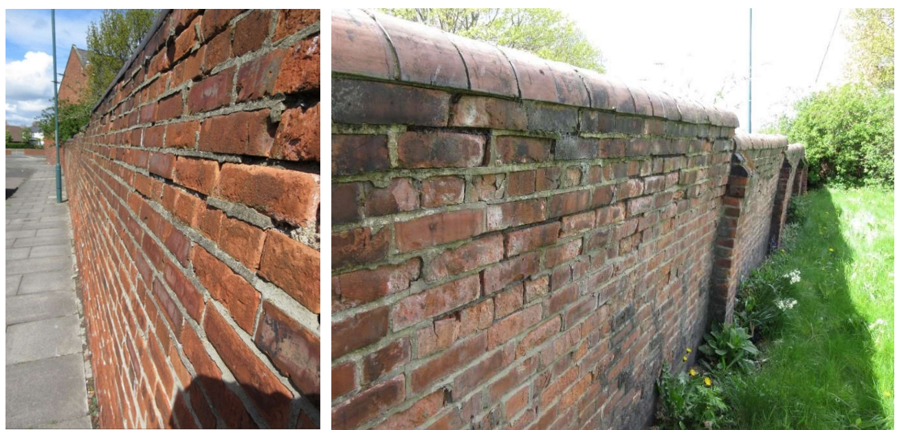
South brick boundary wall decays with significant lean inwards, despite thin piers