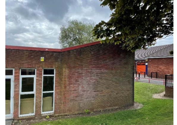
Fig 2 – North elevation former sign area

21. North Elevations. The brickwork generally appears sound. Some mortar joints below DPC level are slightly open, as are some joints above the doors. As noted in the previous report, the movement joint above the fire exit door is cracked, however no pictures were included to see if this has worsened. One brick under the parapet is spalled. The emergency exit doors open onto a level landing with a ramped access to the grassed area adjacent. The mastic pointing to the perimeters of the new uPVC window frames on this elevation is uneven with a hole to the top right of the central panel. An original sign, most probably of individual letters has been removed but the fixing pegs remain.