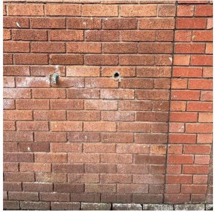
Fig 1 – Holes to west elevation

raised concrete at a former door opening, has an increased localized risk of breaching the DPC. As noted on the previous report, all mortar joints below DPC level are open or lean. 1No. hole as pictured below observed from former service penetration. Original door and window openings have been bricked up.