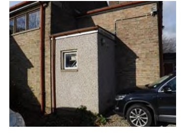
Giving way at the edges