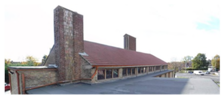
North side plastic downpipes to metal gutters, nave part restored as part of the 2016 nave roof recovering works.