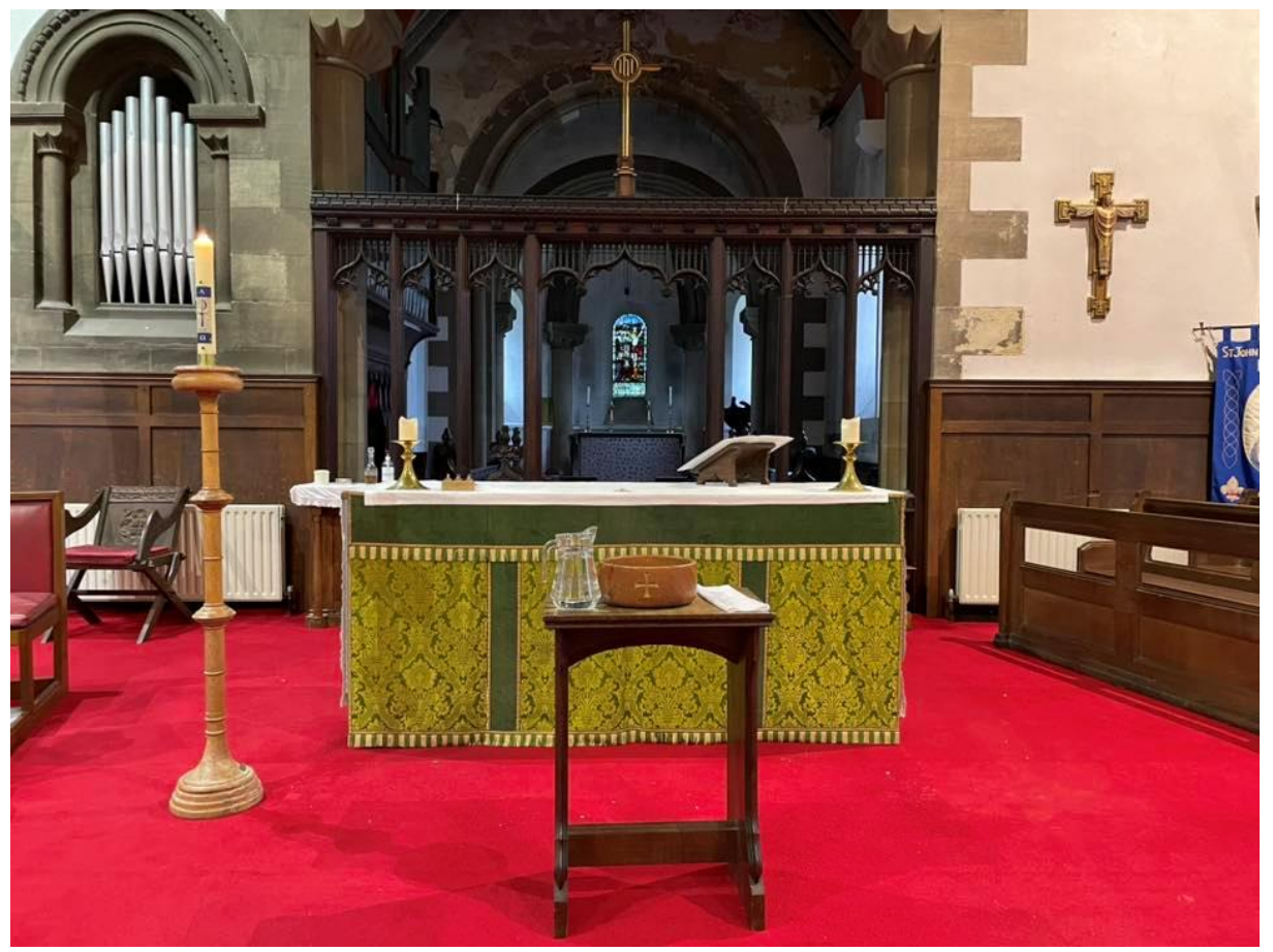
St. John's Church set up for a Baptism Service

The PCC and congregation seek to work with a priest who can help us grow and develop our mission and ministry within Birtley Parish.