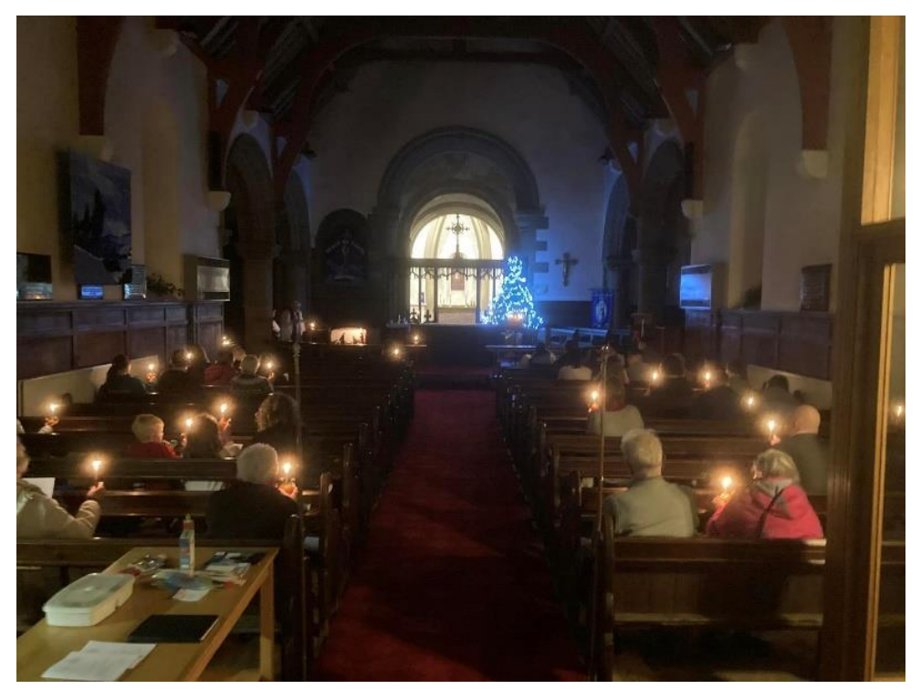
Christingle Service Christmas Eve 2023

In addition to our weekly rhythm of worship, we celebrate special seasonal services such as Christingle and Christmas services, Holy Week and Easter.