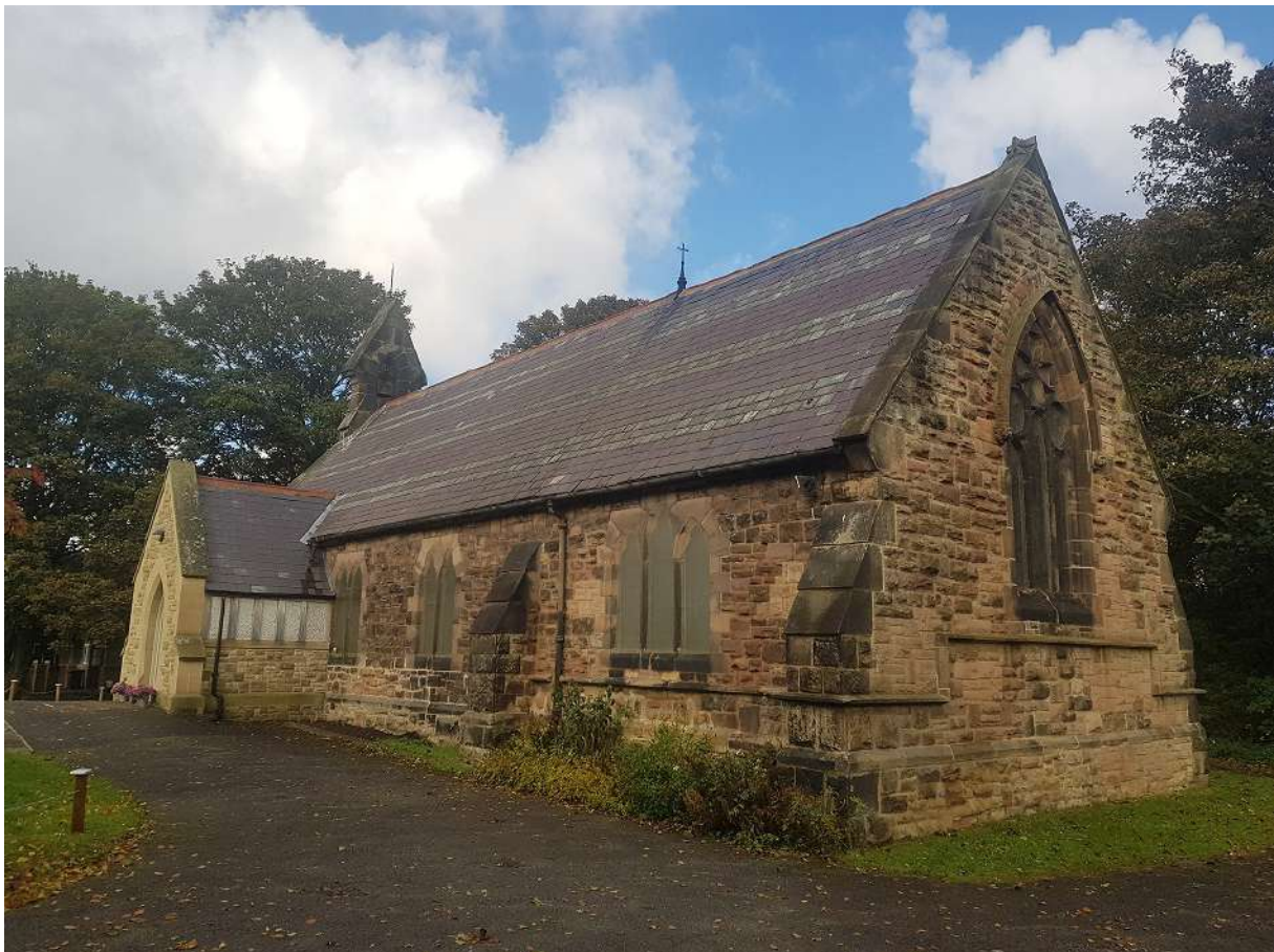
Fig. 3 | Church Photographs (3.1 + 3.2 Exterior)