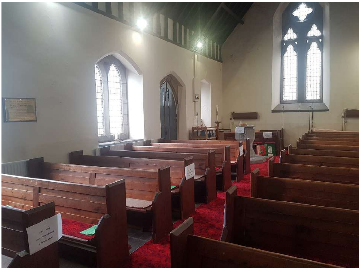
Fig. 4 | Church Photographs (4.1 + 4.2 Interior)