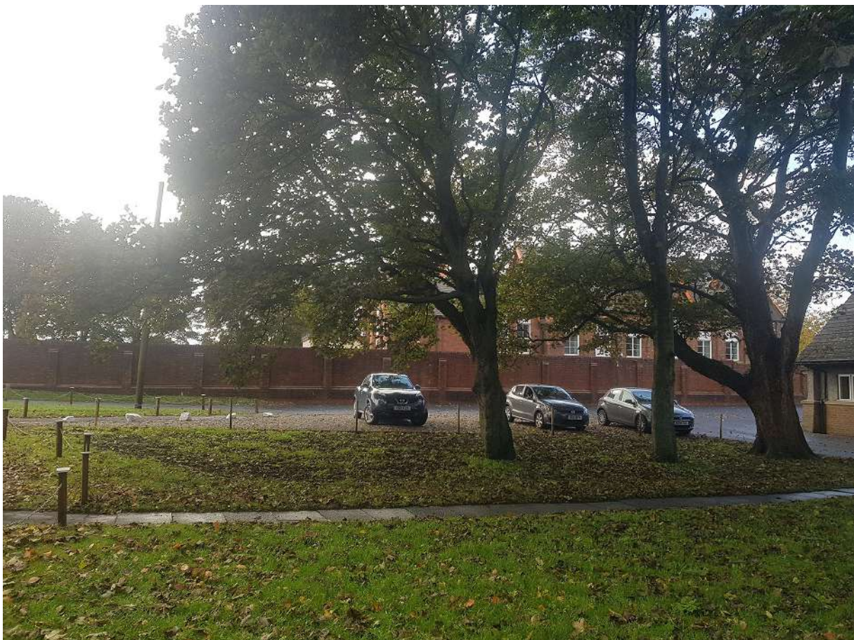
Fig. 5 | Church Photographs (5.1 + 5.2 Church Grounds)