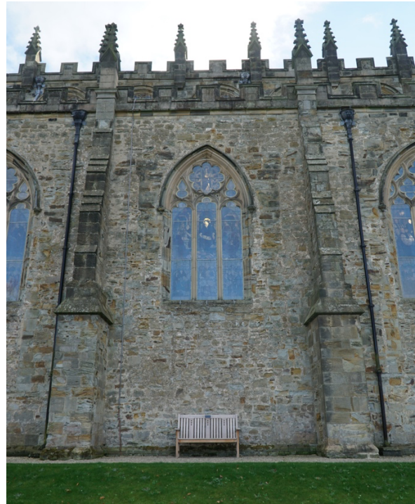
Chapel North Front