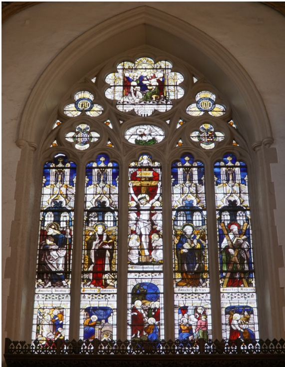
Chapel East Window