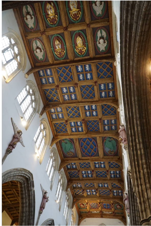
Chapel Interior viewing East to Sanctuary and Nave Ceiling.