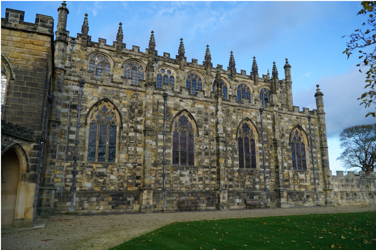
Chapel South Front