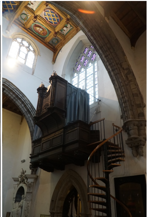
Chapel West End Narthex and Organ Gallery.