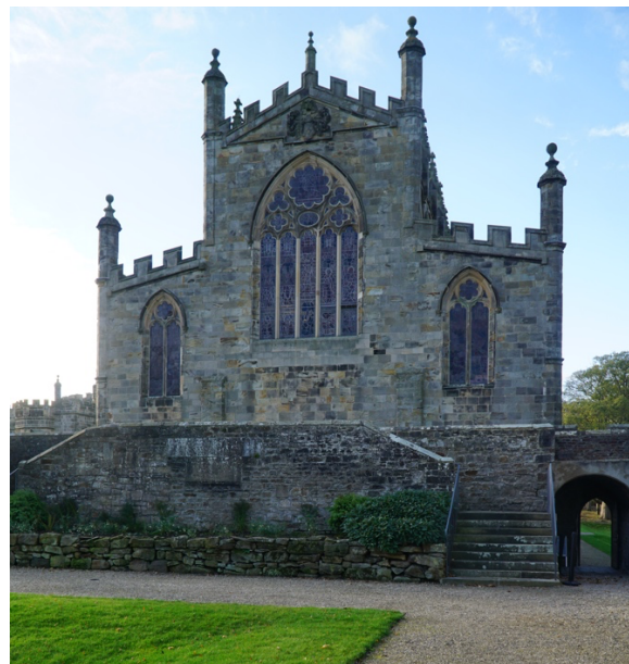
Chapel South and East Fronts