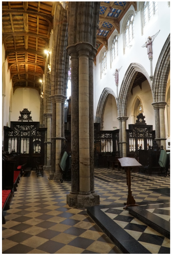
Chapel viewing west to Narthex Screen