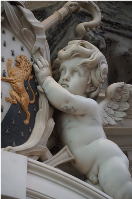
Detail of the Bishop Trevor Memorial by Nollekens