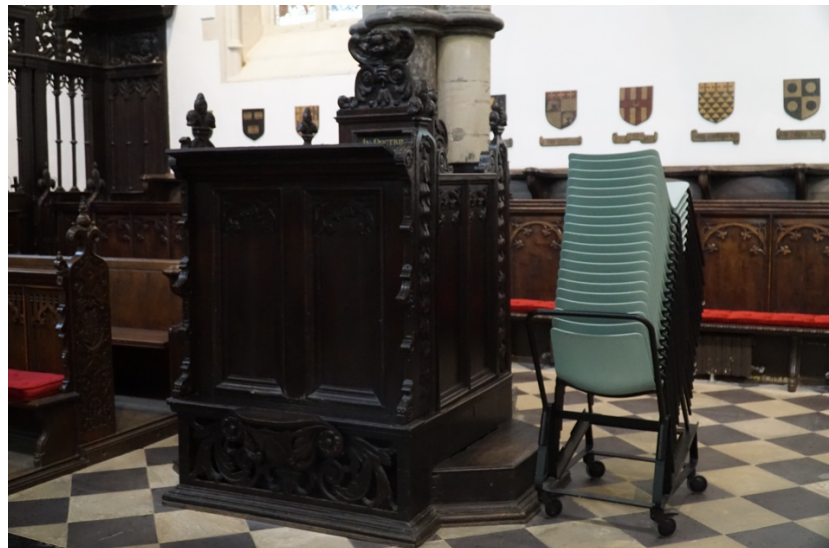
Chapel Interior Bishop John Cosin's Ledger and Reading Desk.